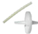
Filtration kit & dessicator kit Cat. No. 13504920